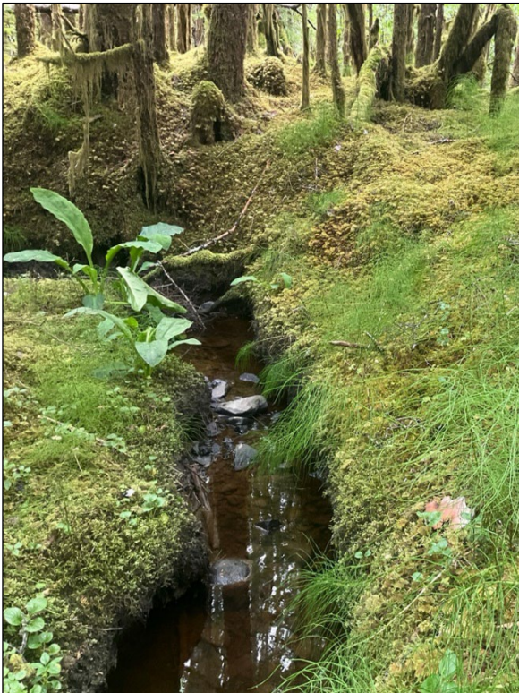
Figure 3.–Channel at waypoint 747.