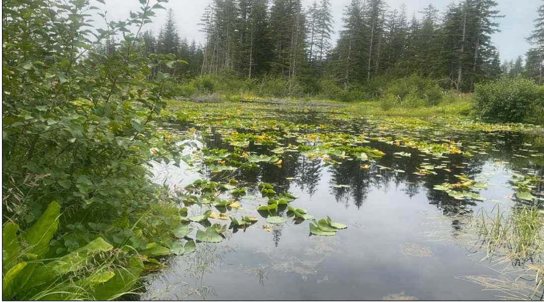
Figure 2.–Pond at waypoint 710.