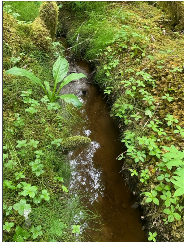
Figure 4.–Channel at waypoint 719.