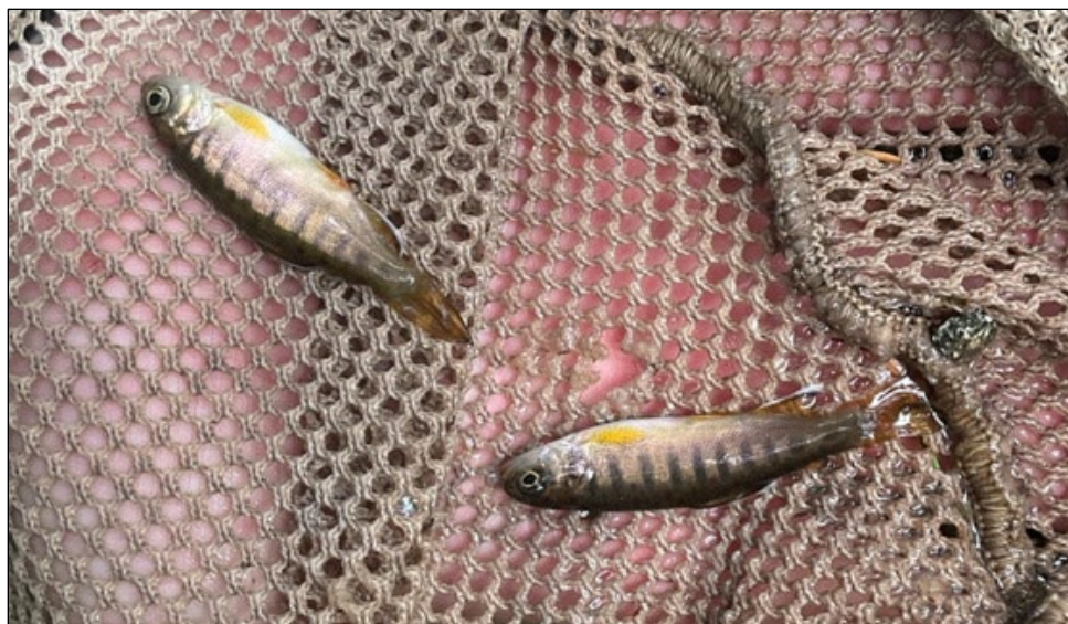
Figure 1.–Juvenile coho salmon caught at waypoint 747.